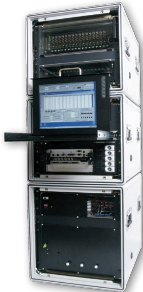
Multi-Channel Optical Seismic Instrumentation