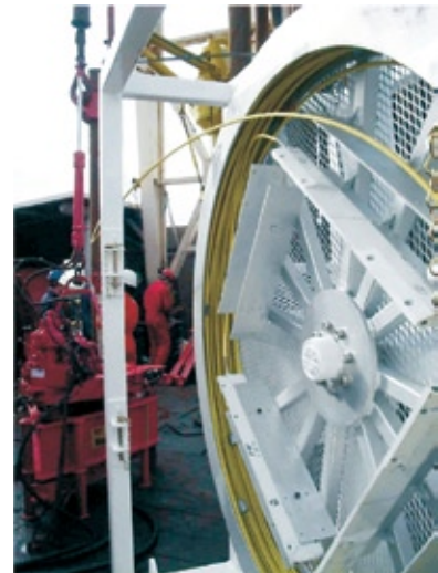
Seismic Array Deployment System

2 Dependent on casing weight and station spacing. Other tubing/casing combinations can be evaluated on request.