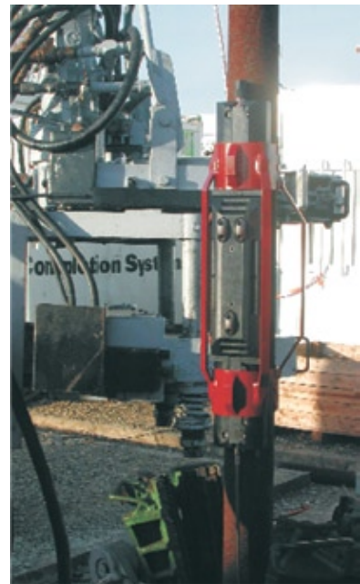
Clamp-on Sensing Station